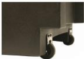
Heavy Duty Casters