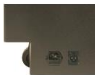
Built-in XLR Audio and AC IEC Power Inlet