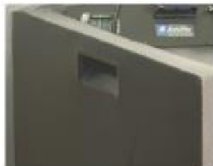
Built-in Pocket Handles for Easy Maneuverability