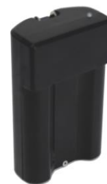
Optional Rechargeable Battery Pack

IF YOU HAVE ANY QUESTIONS OR PROBLEMS PLEASE CALL OUR CUSTOMER SERVICE DEPARTMENT AT 1-800-267-5486