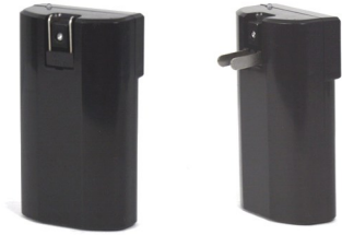
BUILT-IN BATTERY CHARGER